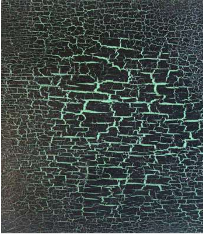
Black over Turquoise