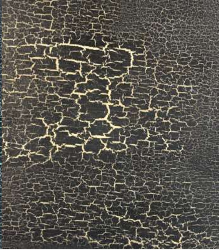
Black over Natural Wood