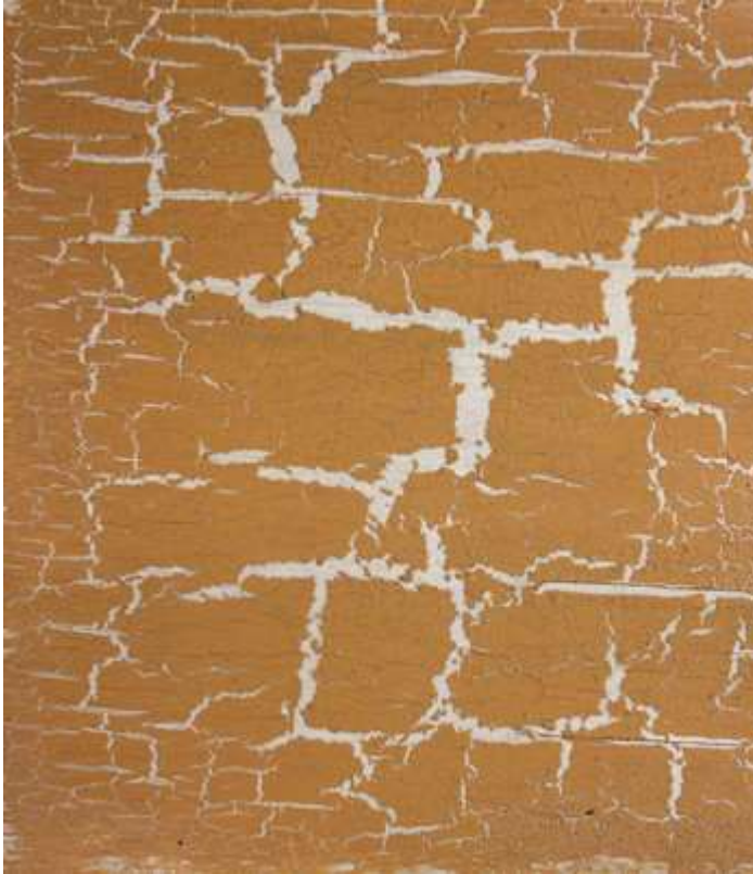
Pig Skin over White