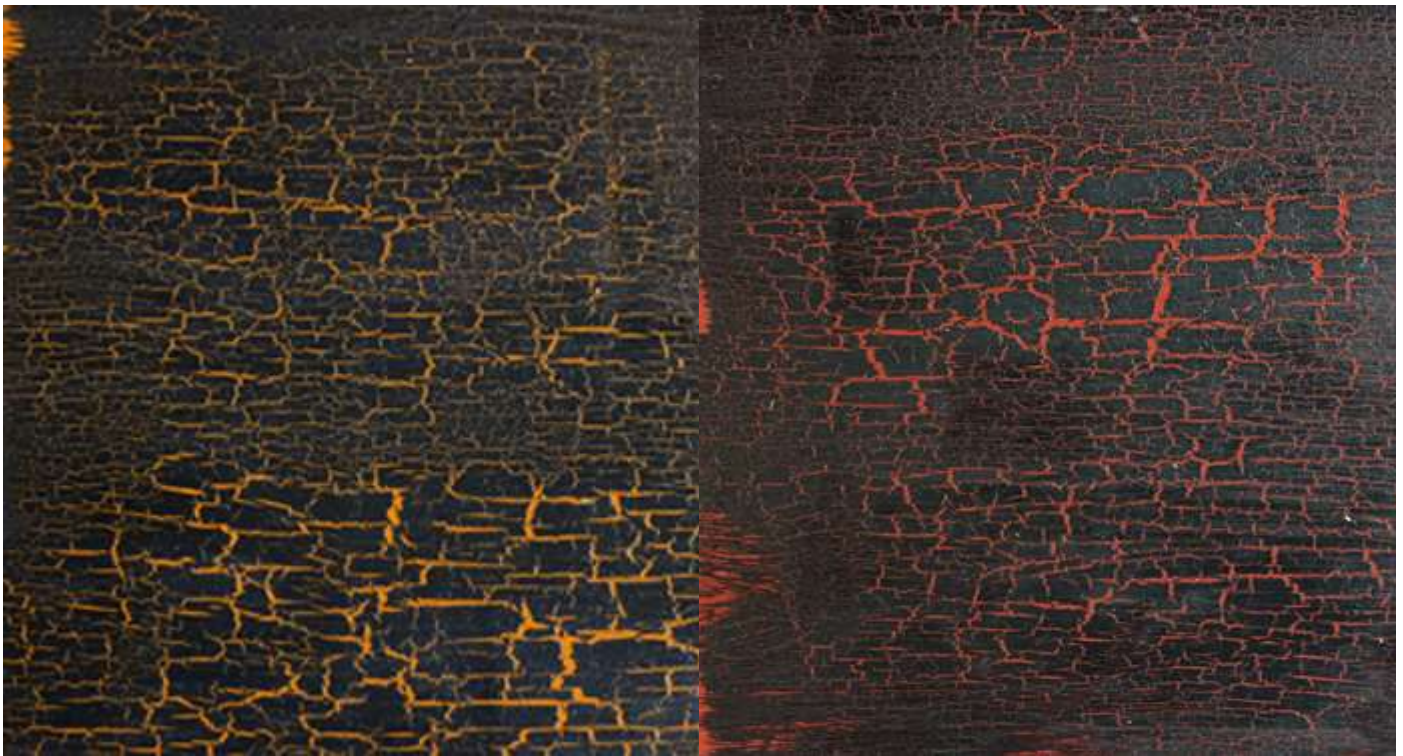
Soldier Blue over Burnt Orange

Solid colors are also possible. Black is a standard color in hammered dulcimers, but other colors would be equally nice, and unique. Soldier Blue? Dark Green? Salem Red? Other possibilities would include spatter paint over a base color. How about a Jackson Pollock style, stand back, and throw paint at it. Again, the possibilities are infinite. If you have an idea, give us a call, and we'll talk it over.