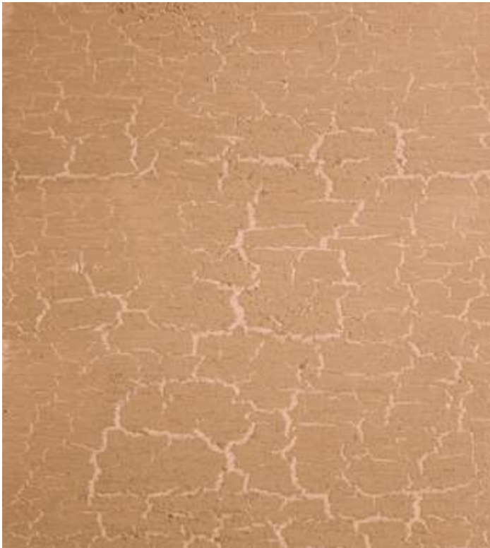
Beige over Light Cream