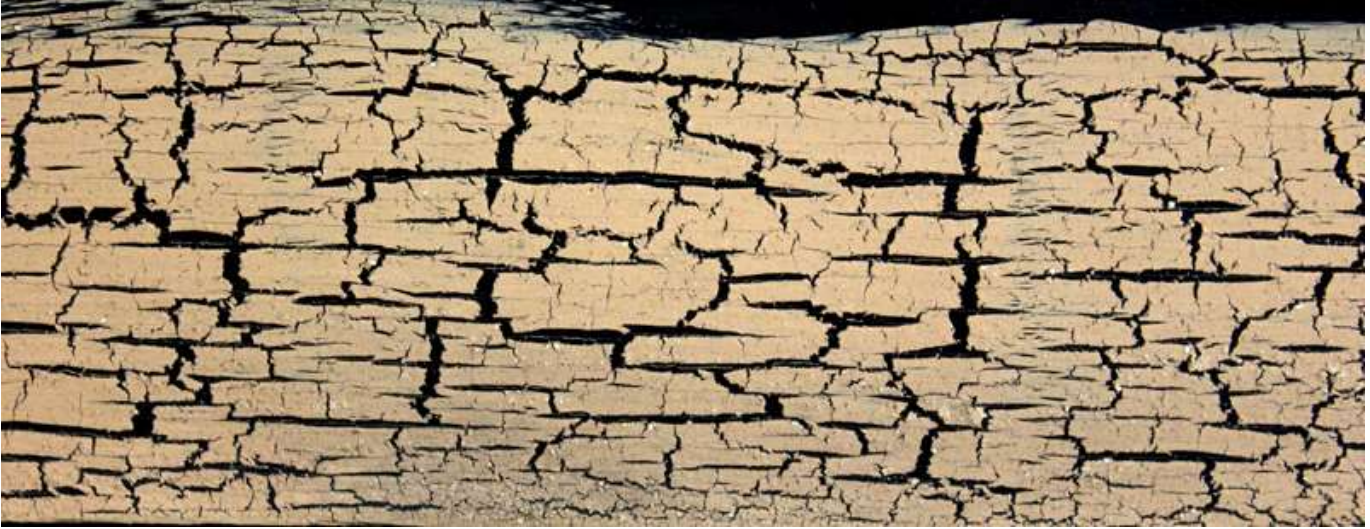
Light Cream over Black