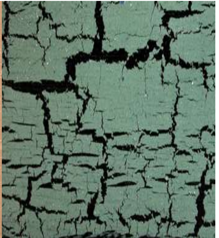
Turquoise over Black