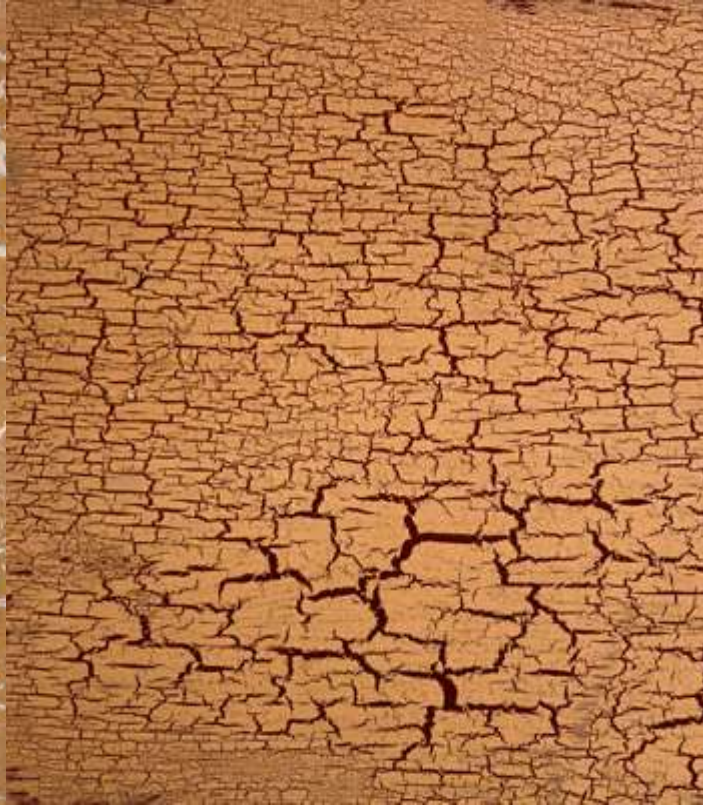
Pig Skin over Barn Red